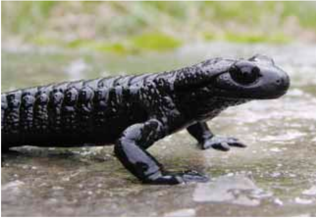
Figure 1. Alpine salamander from the Hinterstein Valley, Bavarian Alps, Germany (not collected).

ropean species and populations unaffected. Here, we report the results of a study on Bd infection in the viviparous and entirely terrestrial Alpine salamander, Salamandra atra LAURENTI, 1768 (Fig. 1). This caudate is endemic to the Alps and the Dinaric Alps (GRIFFITHS 1996).